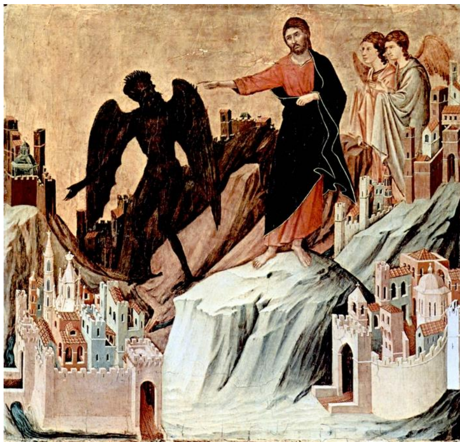
Ilustración de esta semana. La ilustración de la portada de hoy se titula Tentación de Cristo en la montaña. Es uno de los paneles de un retablo significativo construido originalmente para el Duomo de Siena, Italia, llamado La Maestà por el artista italiano Duccio di Buoninsegna. Data de entre 1308-1311. Este panel es parte de la Colección Frick en la ciudad de Nueva York, EE. UU.

Sung Eucharist (Book of Common Prayer) at 10:30 am – page NN