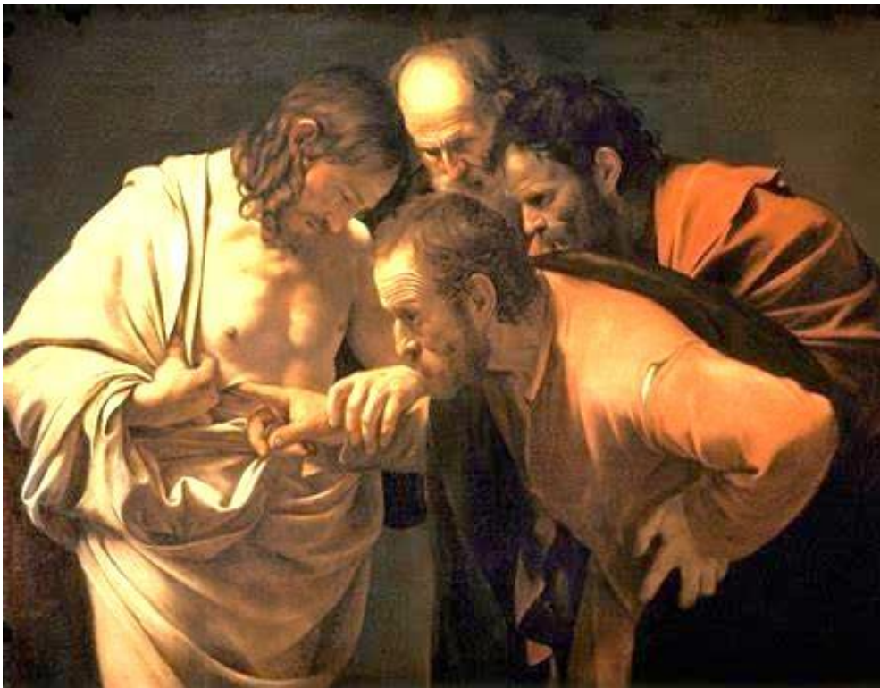
Illustration for today. This is considered to be one of the most famous artistic depictions of this Gospel passage: commonly titled The Incredulity of St Thomas. This version is by Italian realist artist Michaelangelo Merisi da Caravaggio. It dates from 1602 and is housed at the Neues Palais in Sanssouci in Potsdam, Germany.

Second Sunday of Easter ~ El Segundo Domingo de Pascua